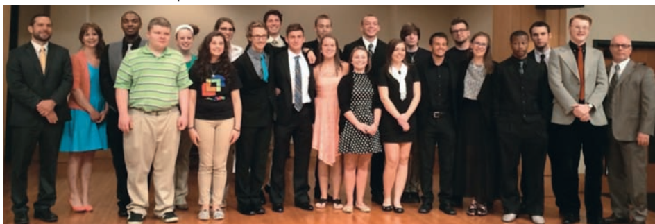
Entrepreneurship Academy 2014-2015 participants

Regardless of the career choice or plans after high school graduation, this opportunity to work in a real-world business atmosphere has given students the skill set needed to succeed in a professional environment. After the completion of year one, the Entrepreneurship Academy has now created a connection between local school districts and its' program encourages creativity and innovation in the development of business. The Pennsylvania Department of Community and Economic Development approved the funding and implementation of the "Science, Technology, Engineering, Arts and Mathematics (STEAM) Project" at LindenPointe. We are looking forward to its future and would like to thank Midwestern Intermediate Unit(IV) who partnered with the Franklin Center of Beaver County, participating school districts, EKME, Gilbert's Risk Solutions, First National Bank, Winner International and anyone else who helped make this opportunity possible.