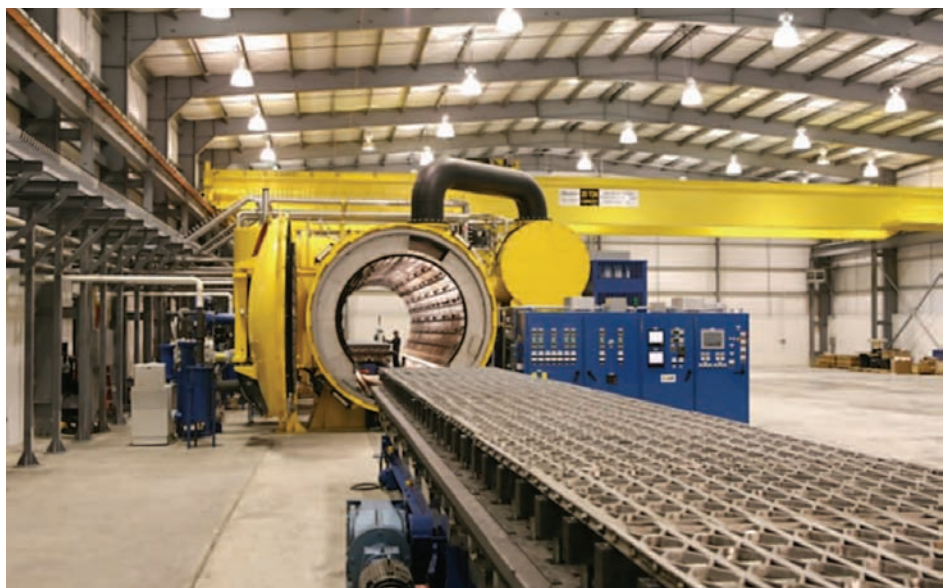
Pictured is a view of a 36' furnace currently at the Western PA facility.