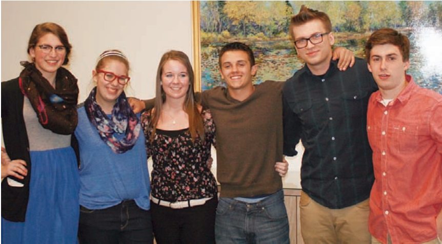
practices that focus on critical thinking, communication and collaboration. I am already delighted with the students' enthusiastic participation and look forward to an innovative year".