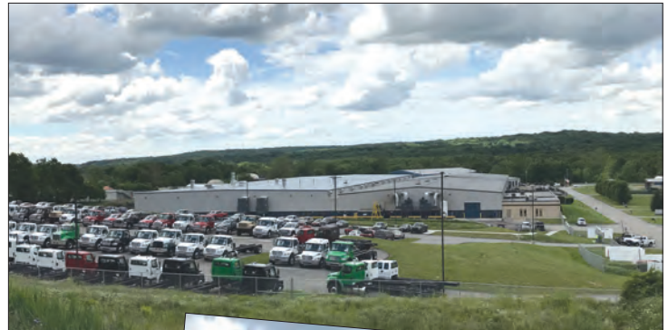
Miller Industries complex in Hermitage.