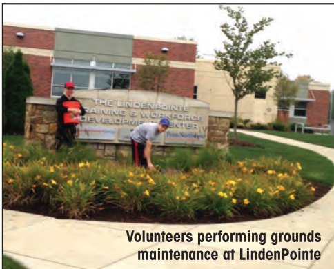
Volunteers performing grounds maintenance at LindenPointe

The students may start earning volunteer hours beginning the summer prior to their freshman year and must acquire at least 150 volunteer hours at a minimum of four (4) eligible community organizations / locations throughout their high school career. The students are