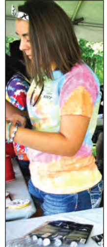
Volunteer at Hermitage Arts Festival

The City of Hermitage has utilized the HHS Silver Cords Program volunteers for special events such as the Hermitage Arts Festival, the Hermitage Holiday Light Parade, the Hermitage Spikeball Tournament and the Hermitage Farmers' Market. Students have also volunteered at various city facilities including the Hermitage Athletic Complex, the eCenter@ LindenPointe and Rodney White Olympic Park. Neil Hosick, Facilities Coordinator and a Silver Cords program contact stated: "This is an amazing program introducing students to volunteerism and providing support for many city sponsored events and at various city facilities. I've thoroughly enjoyed working with these young adults and witnessing their talents."