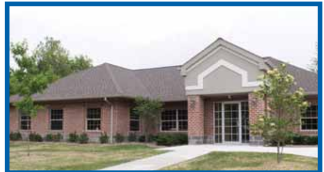
Information Resource Technology, Inc.