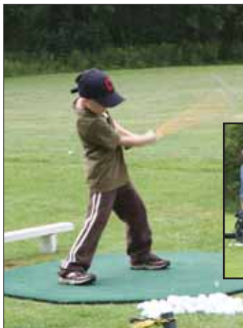
New for 2008: The First Tee of Sharon and the Hermitage Parks & Recreation have joined forces to offer golf lessons to Hermitage residents.