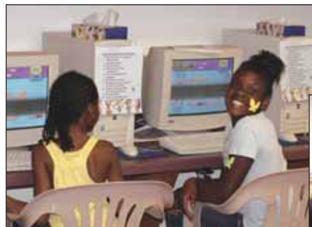
CDBG Funds were used at Orange Village to construct a facility where residents meet daily to enjoy summer and after school programs.