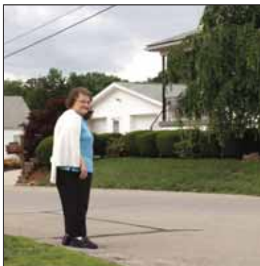
A Patagonia resident enjoys neighborhood improvements thanks to CDBG Funds.