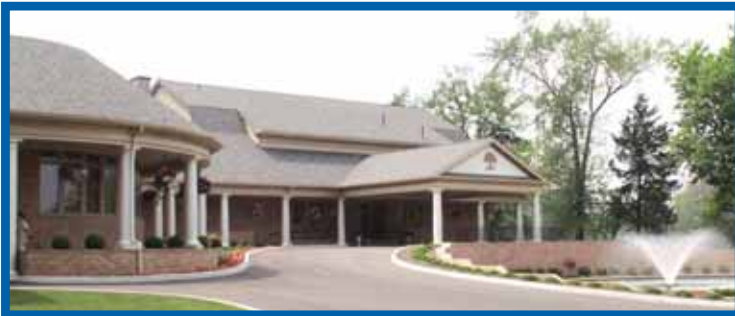
Avalon Golf & Country Club